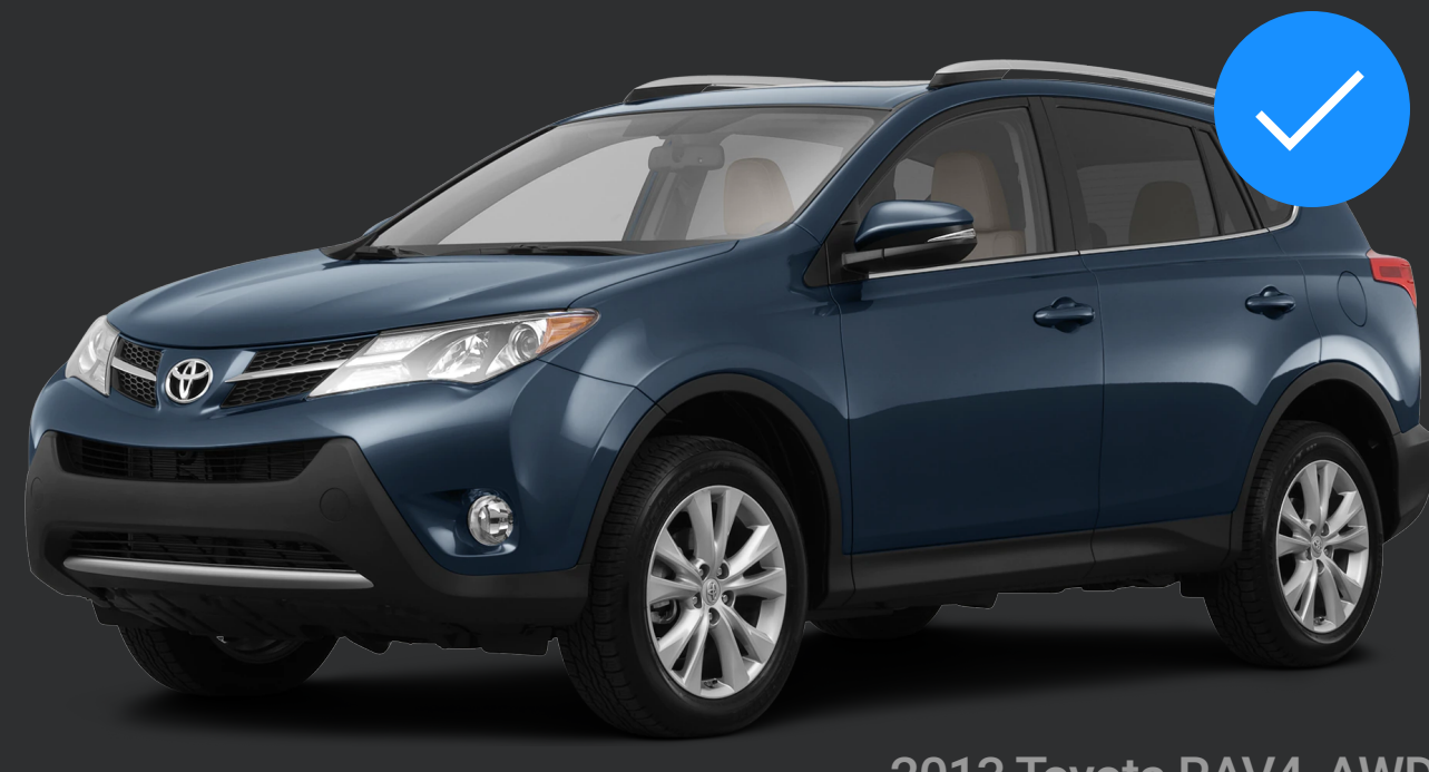
2013 Toyota RAV4, AWD